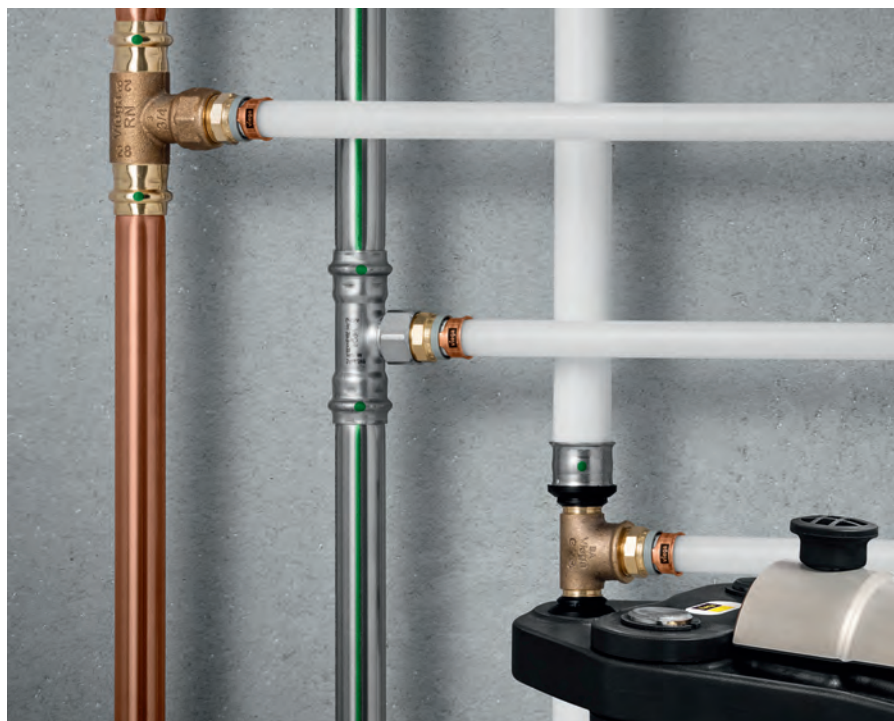
Viega Speedpress is fit for connection to all riser pipes, whether made of plastic, stainless steel, or copper.

This system with more than 400 different components offers a wide selection of press connectors in dimensions from 15 to 54 mm. The pipeline installations made of high-alloy stainless steel are suitable for hygienic potable water installations e.g. in hospitals.