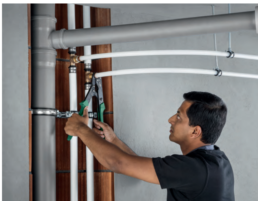
A strong team: Viega Smartpress for riser pipes, pressed with the Viega Pressgun, and the threaded transition to Viega Speedpress for the rest, while using the Viega hand press tool.