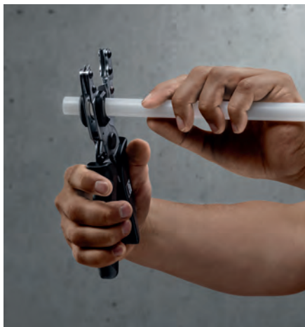
Step 1: Cut The pipe is cut to the required length. Since pipes are delivered in coil form, unnecessary wastage could be avoided during cutting.

The new Viega Speedpress makes potable water installations simple and handy. And this is how it works: