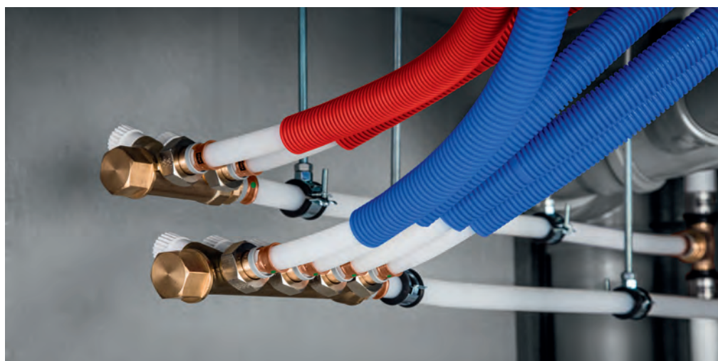
Manifold installation with single lock for every outlet point.

Having one connection to the manifold and one to the tap furthermore creates two constantly accessible connection points in front of the wall, making it easy to isolate problems, e.g. in case a tap requires repair, the other appliances can still be used.