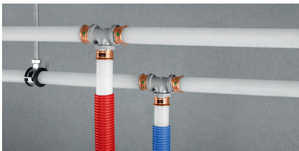
Potable water installation with T-pieces.

The customary type of installation for drinking water is the T-piece installation in which each outlet point is connected to a branch line. Due to its good flow characteristics, Viega Speedpress can be downsized to 16 mm for outlet points like toilets or washbasins – that saves material costs.