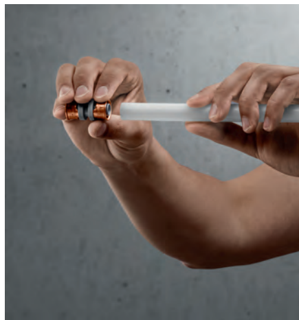
Step 2: Insert Next, the pipe is simply inserted into the connector, until the pipe is visible in the large inspection window.