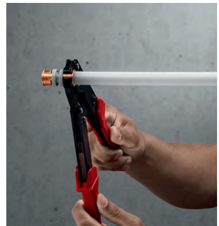
Step 3: Press Last, the connection is pressed with the new hand press tool, which hardly takes few seconds. The SC-Contur ensure additional safety.